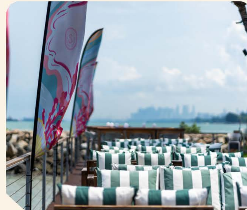
Poolside Deck (Maximum of 70 seats, Mixture of Sofas and High Tables)

Monday to Thursday (5pm to 10pm) $3600++