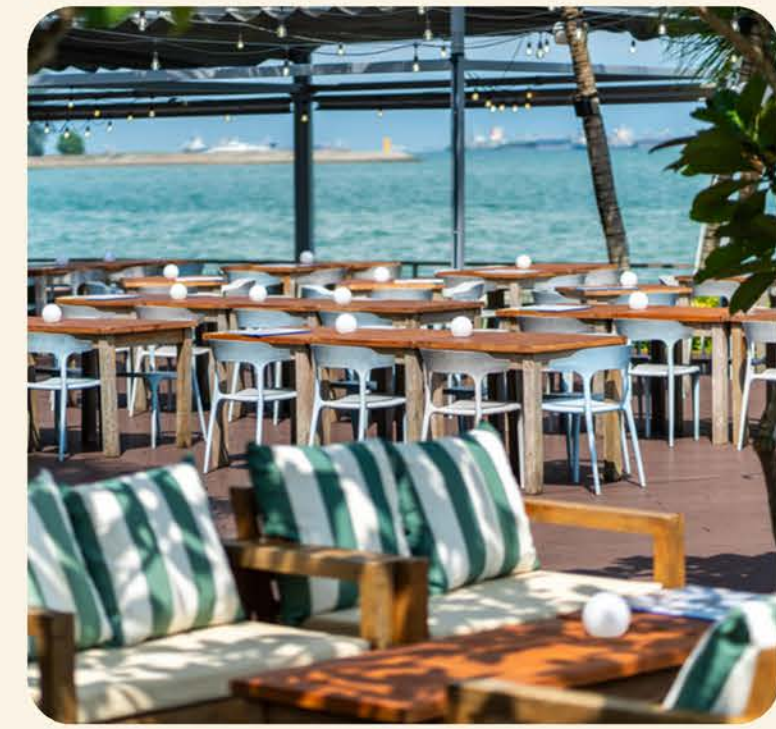
Outdoor Deck (Outdoor, Non-Sheltered) – Maximum of 106 Seats, Mixture of Sofas and Low Tables

Saturday, Sunday, Public Holidays 12pm – 4pm - $5800++ 5pm to 10pm - $8000++