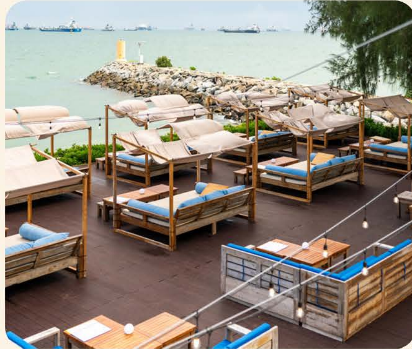
Infinity Area (Outdoors, Non-Sheltered, Maximum of 140 seats, Pets Friendly, Mixture of Sofas, Daybeds, High and Low Tables)

Saturday, Sunday, Public Holidays 12pm – 4pm - $5800++ 5pm to 10pm - $12800++