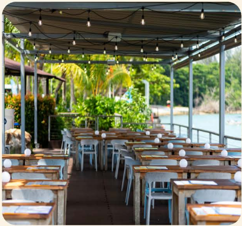
Seaside Deck (Outdoor, Partial Sheltered, Maximum of 128 Seats, Low Tables Only)

Monday to Thursday (5pm to 10pm) $7800++